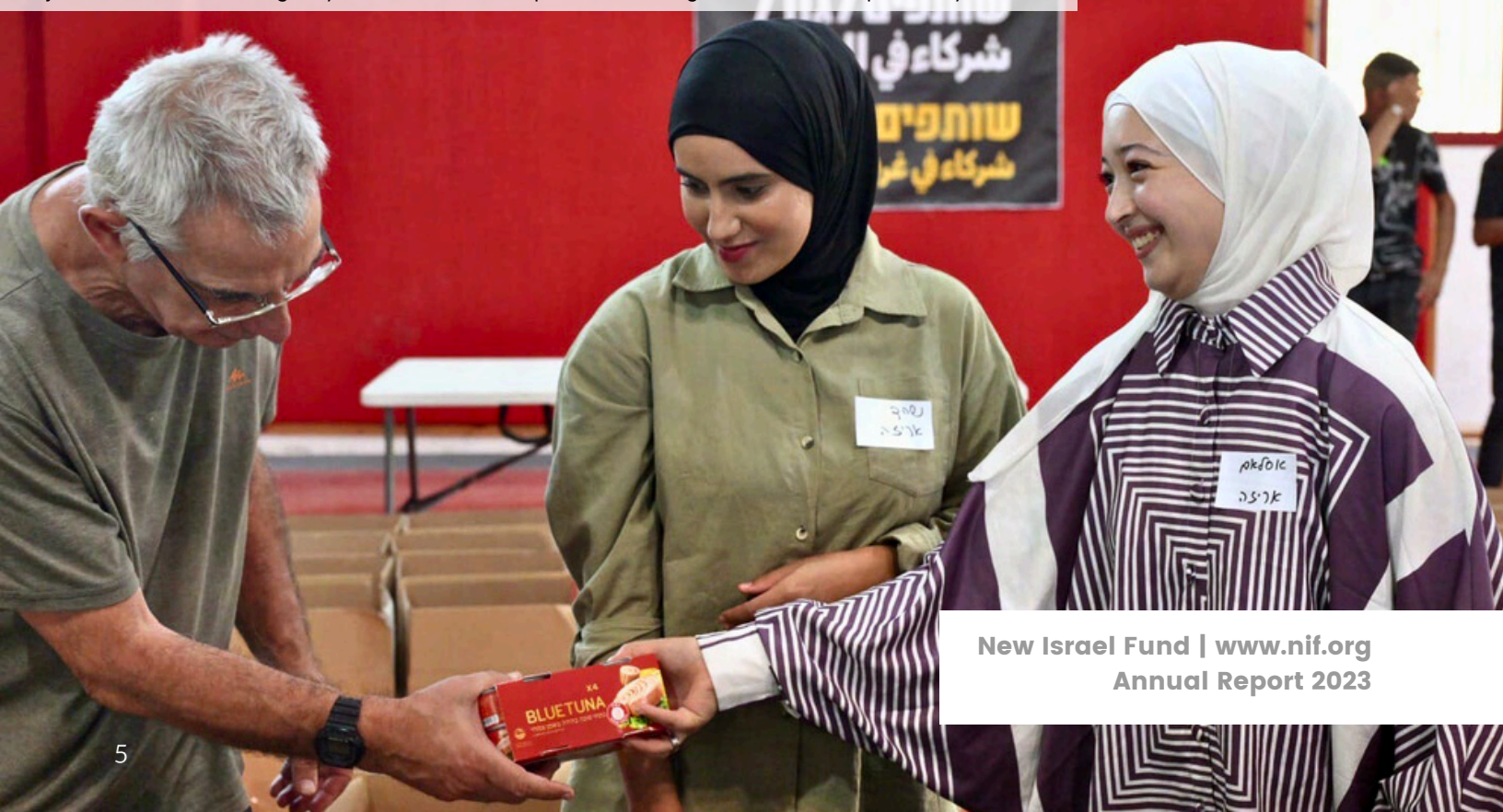
The joint Jewish-Arab emergency aid center in Rahat provided basic goods to those displaced by October 7.

New Israel Fund | www.nif.org Annual Report 2023