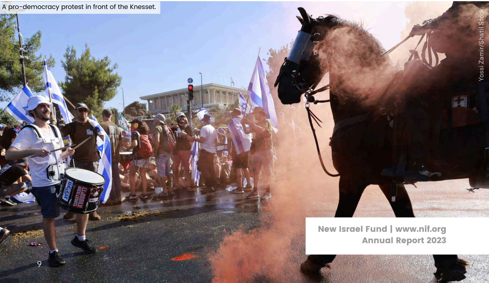
A pro-democracy protest in front of the Knesset.

New Israel Fund | www.nif.org Annual Report 2023