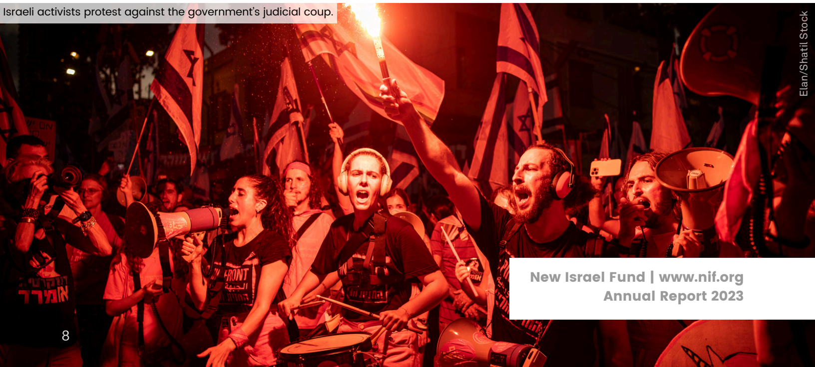
Israeli activists protest against the government's judicial coup.

Block Harmful Anti-Democratic Legislation: Israel's Supreme Court struck down an amendment to the "reasonableness clause"—the cornerstone of the government's plan to overhaul the judiciary and remove basic checks and balances in Israel's governing system in response to a petition by ACRI representing 38 organizations. NIF and—partners also were instrumental in thwarting a bill that, if passed, would levy a 65% tax on donations from foreign governments to NGOs.