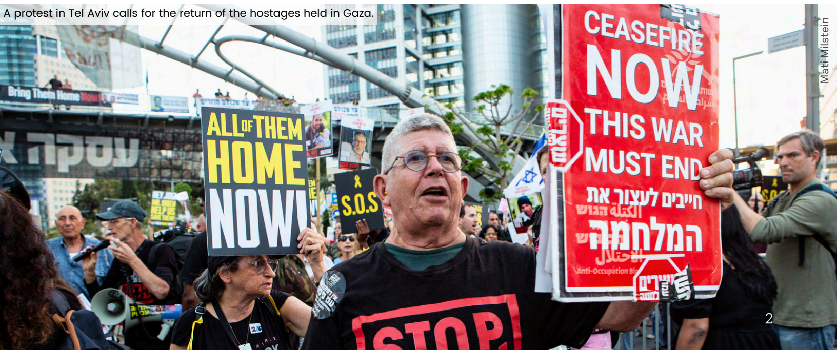
A protest in Tel Aviv calls for the return of the hostages held in Gaza.

And then, following the horrifying attacks of October 7, NIF sprang into action, helping to fill the void left by the government's woeful response and to maintain democratic norms in an increasingly illiberal environment—one marked by a rise in incitement by Jewish supremacist voices and intense pressure to shut down dissent. We helped hundreds of thousands of internally displaced Israelis—including those from marginalized communities—with basic needs of shelter, food, and psychological support.